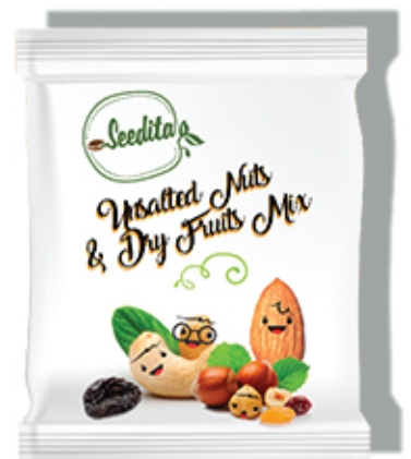
Dry Fruit + Unsalted Nuts Mix